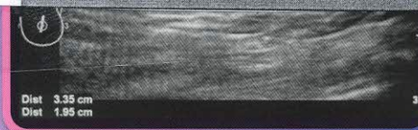
Ultrasonography of the patient's left breast mass. Irregular retroareolar lesion