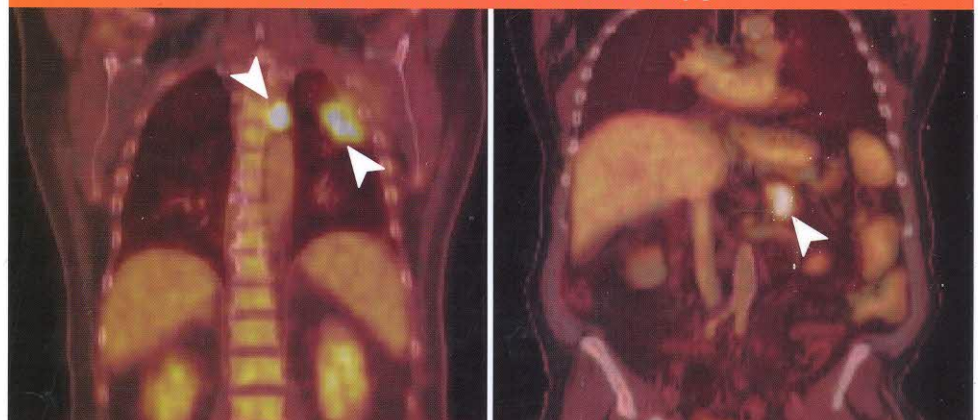
PET/CT Before immunotherapy

Localized hypermetabolic foci at left 4 th rib, paraesophageal node and left suprarenal gland.